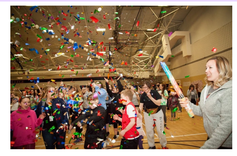
Top left: Teddi 37 Development Committee smiles for the camera

Top right: The Teddi Dance for Love celebrates after the big reveal