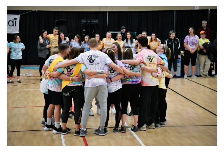
Campers enter the dance in style