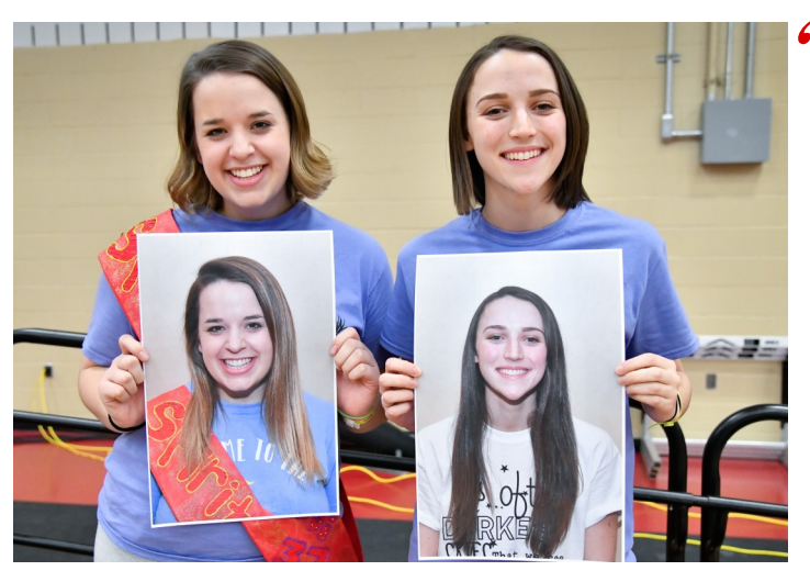
Dancers join together to reflect on their 24 hours of dancing

Two dancers showoff the lengths they went to for love